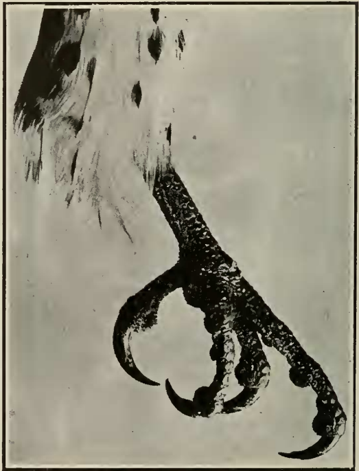
Falco mexicanus , Prairie Falcon, male. (No. 3154 collection of Oberlin College. W. L. Dawson, April 3, 1896, Chelan, Wash.)